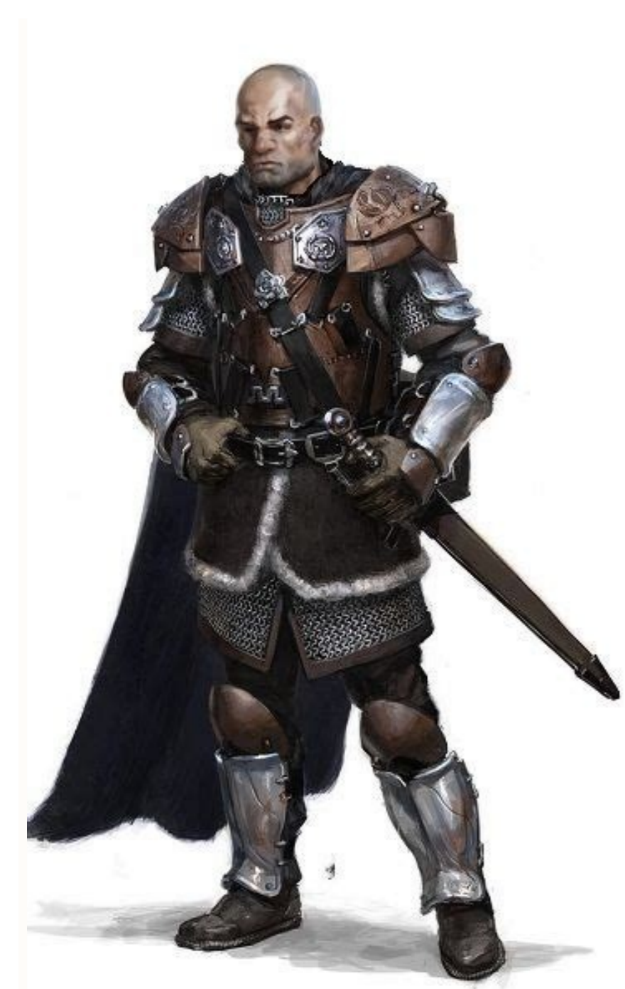
Dnd mercenary background. Dnd 5e background mercenary veteran. Dnd background mercenary veteran.